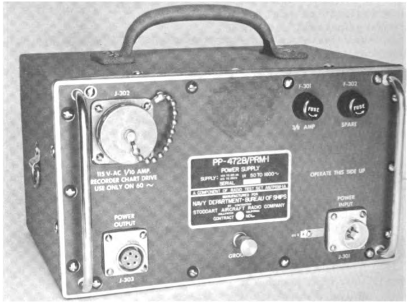
Figure 3. General view of the power supply PP-472B/PRM-1 with the protective panel removed.

The equipment can be operated on a bench or table, or simply placed on the ground. The rod and loop antennas can be connected directly to the RI-FI meter front panel. Mounting provisions for the antennas are such that they mount