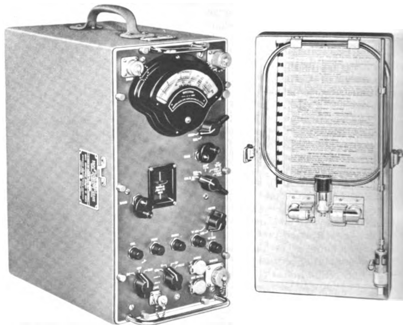
Figure 1. Radio interference-field intensity meter IM-37A/PRM is the control and metering unit of the AN/PRM-1A.

A radiated field intercepted by a vertical antenna will set electrons in motion in the antenna. This electron flow constitutes a current that varies in accordance with the variations of the field. The induced current in the antenna is not uniform but becomes zero at the top. The voltage effective in producing the current measured at the antenna base is equal to an effective height times the electric intensity of the field.