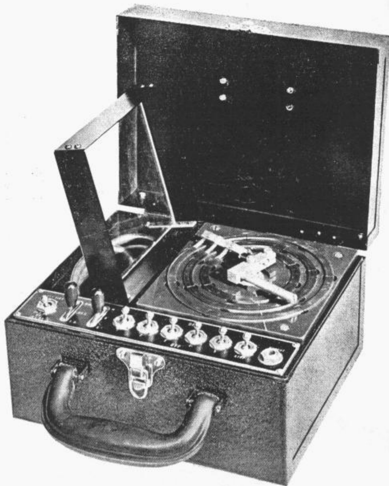
Fig. 1—100A Teletypewriter Test Distributor (Front View)

2.02 Accuracy of Signals: When the 100A teletypewriter test distributor is in proper adjustment, the undistorted signals produced by it have no more than about 1 per cent distortion. The bias and end-distortion are within the range of 19 to 21 per cent (the specified value is 20 per cent).